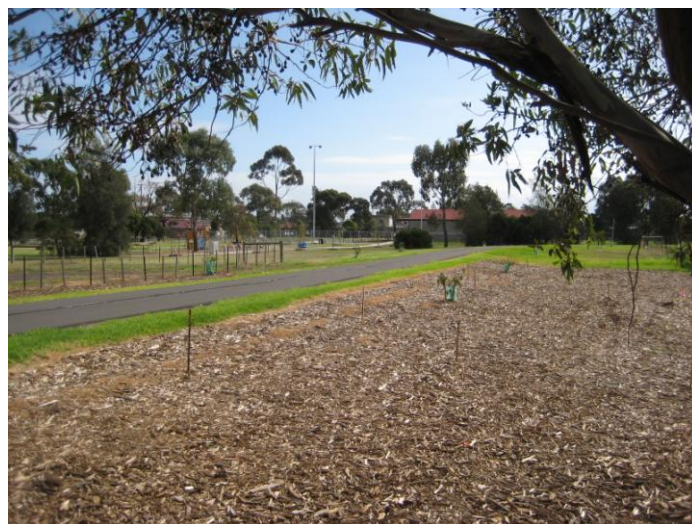
Planting Areas – Brooklyn Federation Trail Park