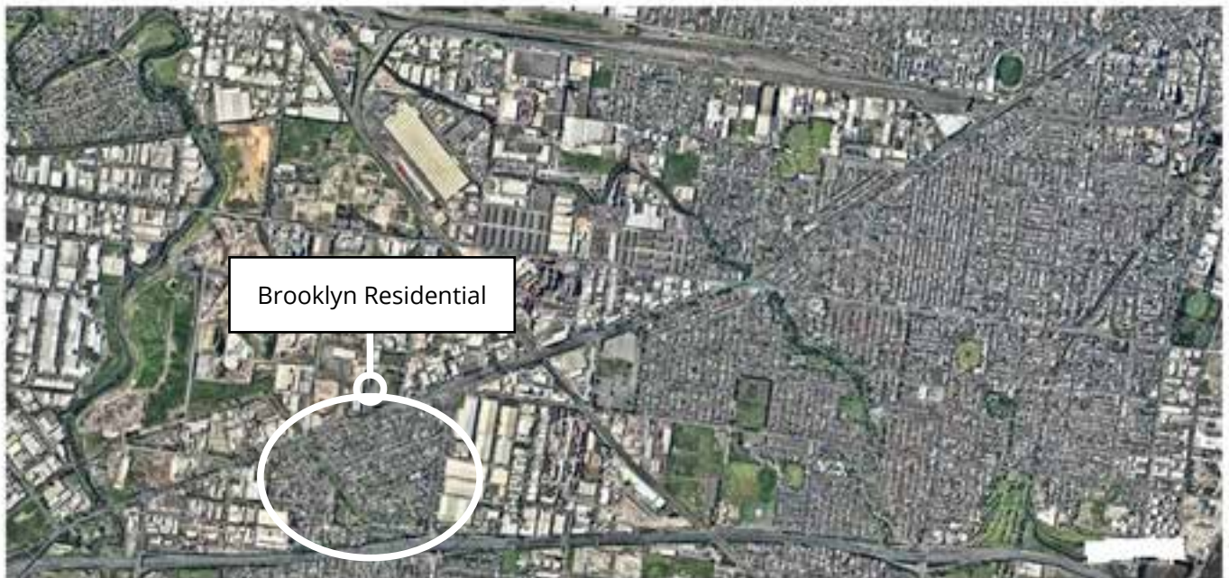
Figure 1 Brooklyn Oct 2016

Brian Long , local resident, conducted a survey within the residential area in Brooklyn. He randomly selected sixteen homes and asked the occupants the following six questions: