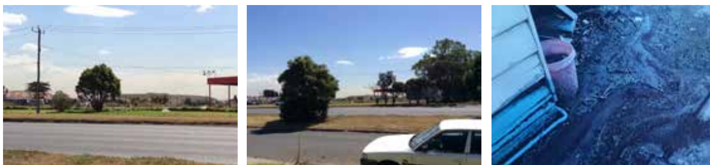
Figure 3 Stockpiles visible from Geelong Rd and dirt accumulating around the house

At the July BCRG Tim Watts MP pointed out that the issue is related to larger PM10 particles and not the finer PM2.5 particles. Personally, the effects from dust are overwhelming and there has been no change.